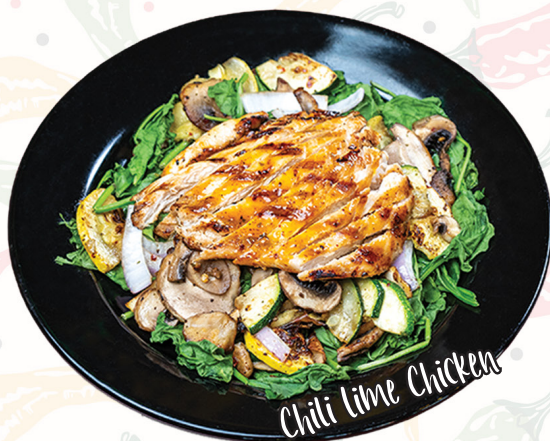
Chili Lime Chicken

CHILI LIME BOWL Fresh spinach, sautéed squash, zucchini, mushrooms, and red onions topped with your choice of chicken breast, beef, or shrimp marinated in a delicious chili lime dressing. Level it up with sweet & spicy peach BBQ Sauce. Chicken 14.49 Beef 16.49 Shrimp 17.49