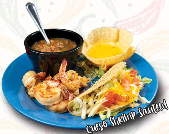
Queso Shrimp Sautéed

CHIMICHANGA* chicken fajita meat wrapped in a flour tortilla with mixed cheeses, fried and topped with your choice of sauce. 17.49 beef 19.49