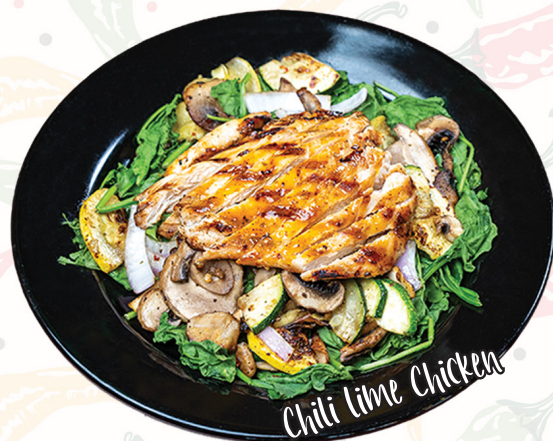
Chili Lime Chicken

FAJITA BOWLS Choice of fajita meat (beef or chicken) along with black beans and ranchero sauce on a bed of rice topped with our mixed cheese. 14.49 for chicken 16.49 for beef