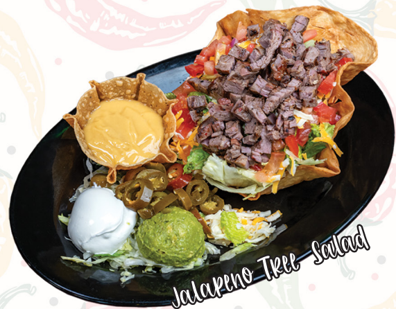
Jalapeño Tree Salad

SOUTHWESTERN TORTILLA SOUP spicy chicken in a cheesy tortilla soup topped with tortilla strips. cup 7.49 bowl 11.49