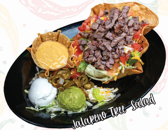
Jalapeño Tree Salad

SOUTHWESTERN TORTILLA SOUP spicy chicken in a cheesy tortilla soup topped with tortilla strips. cup 7.99 bowl 11.99