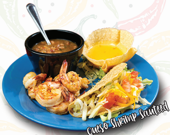
Queso Shrimp Sautéed

CHIMICHANGA* chicken fajita meat wrapped in a flour tortilla with mixed cheeses, fried and topped with your choice of sauce. 17.99 beef 19.99