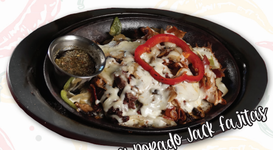
El Dorado Jack fajitas