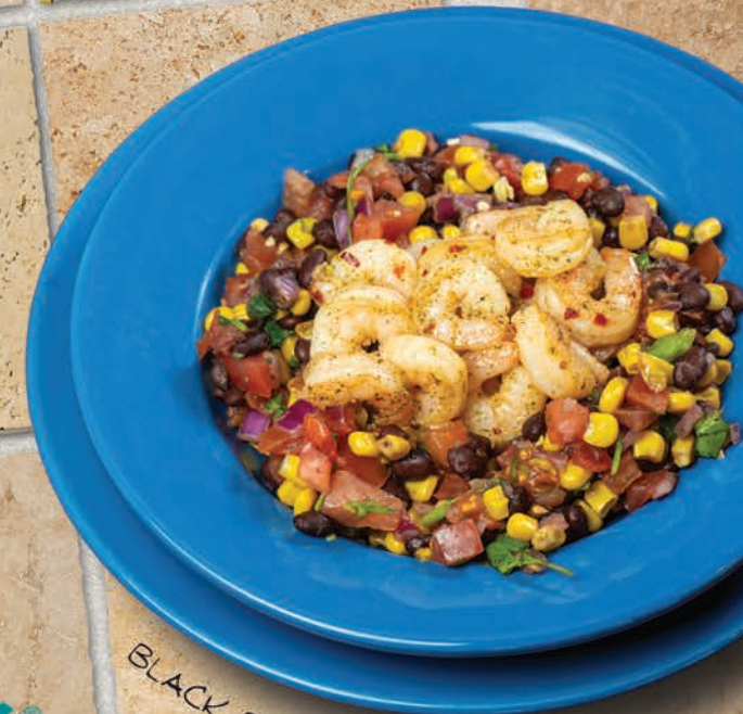
BLACK BEAN SHRIMP BOWL