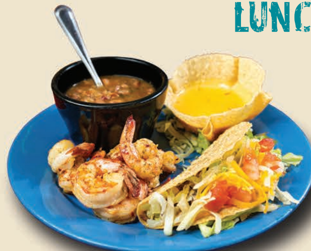
QUESO SHRIMP SAUTÉED

QUESO SHRIMP SAUTÉED* jumbo shrimp, fried or sautéed, served with a crispy beef taco, queso, and charro beans. 16.49